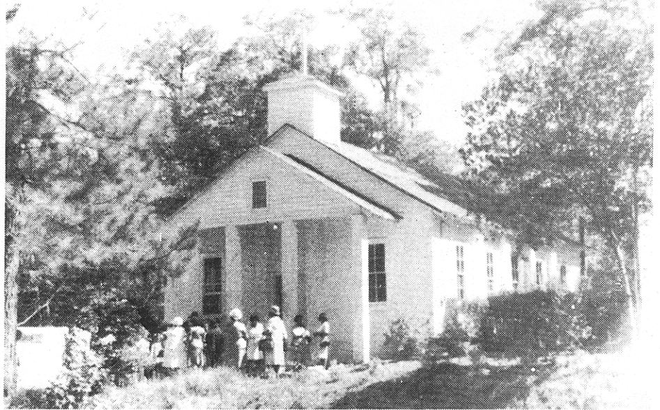
EVERGREEN UNITED CHURCH OF CHRIST, Beachton, Georgia

POSTMASTER: Send Form 3579 to P.O. Box 29833, Atlanta, Ga. 30359